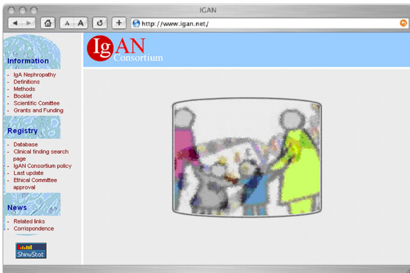
Figure 1 IgAN Consortium website structure.

The main aim of the project was to constitute a genomic DNA bank of well characterized IgAN patients and their relatives from three different European countries (Germany, Greece and Italy) to be used for genetic studies. The following objectives were reached: